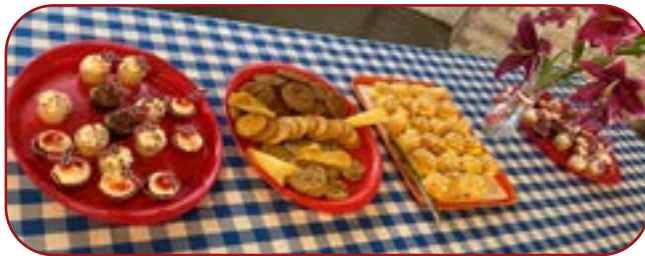
Norway Park Anniversary Desserts