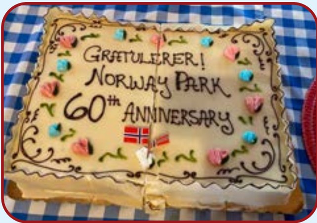
Traditional Marzipan Cake

In the Summer of 1963, Norway Park was a simple wooded area of dirt roads that once was used for logging in the early part of the twentieth century, the old red house restored from a former farmhouse, used for the caretakers of what became Leif Erikson Recreational Association. The lower park was a field of overgrown shrubs, grass, and no sandy beach a long Lake McMurray, a railroad crossing, all waiting to be transformed into the lower park and upper park we see