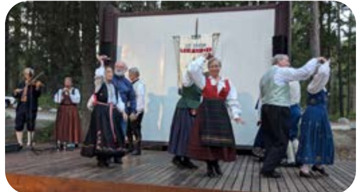
Leikarringen dancing at State Parks Mountain Melodies program