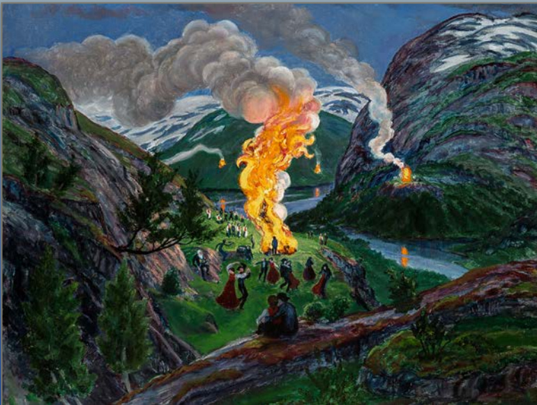
"Midsommer Bål" av Norsk kunstner Nikolas Astrup, 1880-1928.