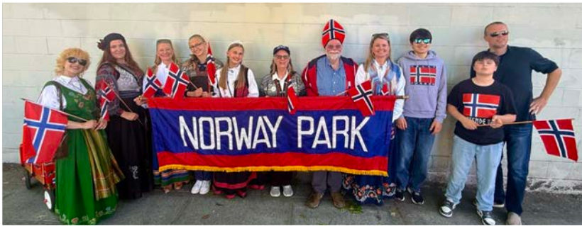
Syttende Mai 2026 with the Norway Park participants in the Ballard parade