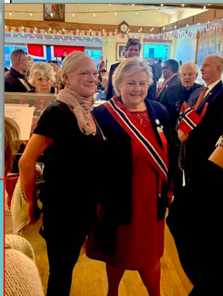
Erna Solberg i Leif Erikson Lodge og Nordic Heritage Museum