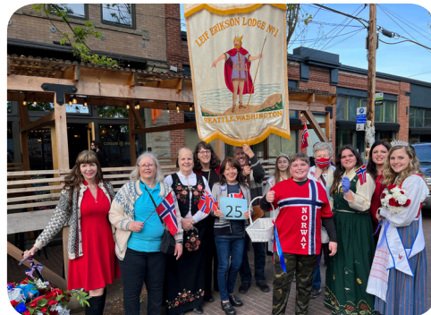
Leif Erikson Lodge parade unit small but mighty