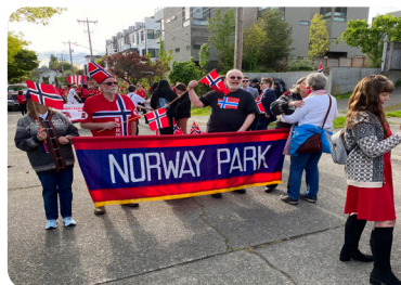
Norway Park contingent