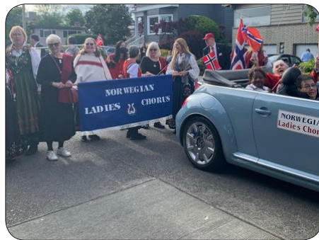
Norwegian Ladies Chorus preparing for parade