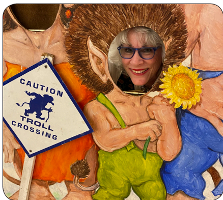
Kaylene the Troll