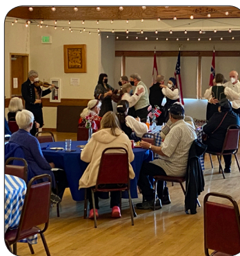
Leikarringen performin- g at Open House