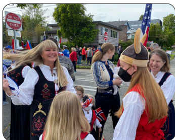
Sunnmorslaget av Seattle