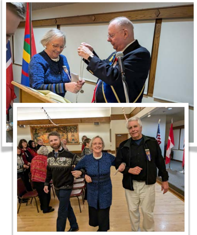
The January Installation Ceremony at Leif Erikson Lodge