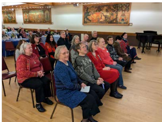
New LEL Officers being sworn in for 2025