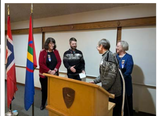
The January Installation Ceremony at Leif Erikson Lodge