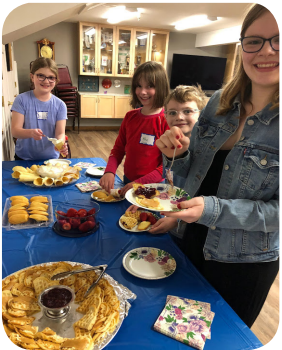
Treats for Barne kids

After such a fun opportunity to have the Barneleikarrigen visit us in April for a tutorial of dances, we invited them to return in May to practice dances to be performed during the Ballard Syttende Mai Parade. We look forward to having them return again in the future to engage with youth of the Lodge!