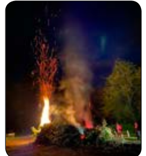
Sankt Hans bonfire at Norway Park