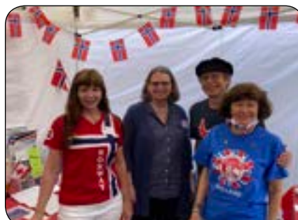
LEL members staffing Ballard Seafood Festival booth