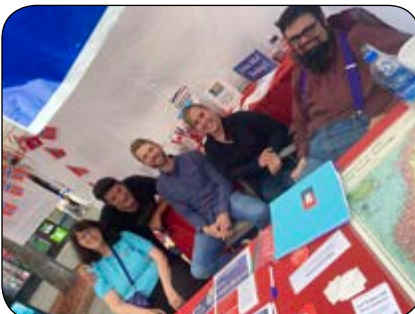
LEL Members at Ballard Seafood Festival

PLEASE COMPLETE BOTH SIDES OF THE APPLICATION! THANK YOU