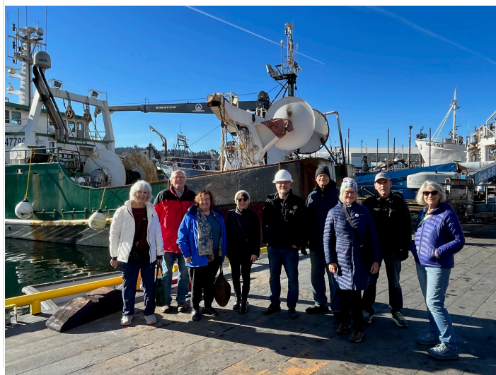
Cultural tour group to Pac Fish shipyard Nov. 17th

In this introductory class we will cover European-styled carving chisels and gouges, learn important carving techniques with wood and basic tool sharpening. The project design is a “Fleur-de-lis”, a symbol used for centuries throughout Europe. This style of carving is called “Dølaskurd” and typical for Gudbrandsdalen. A basic set of tools is available to use in the class. The wood material is included in the class fee. Three class sessions, 3 hours per session / 9 hours total, $125.00 plus $25 material fee = $150 total. To reserve your space call 206-330-5068. or email markcolsen55@ya-hoo. com