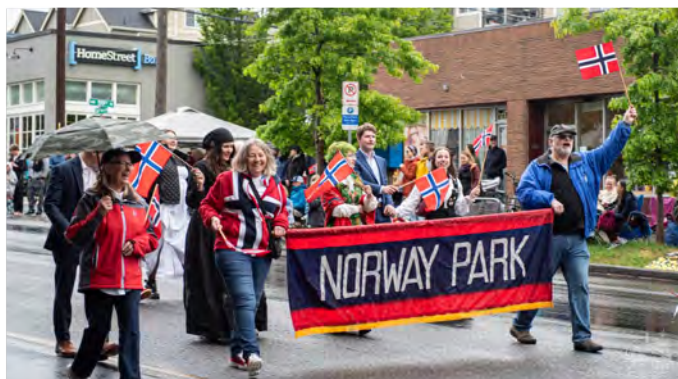
Norway Park marchers in the 17.mai parade in Ballard.

A long summertime tradition at Norway Park returns on Sunday, the 29th of June, starting from noon until 5 PM. A complete Salmon meal for $20 at the Lower Park at Berg Pavilion. Proceeds help nearby Lake Mc Murray firefighters.