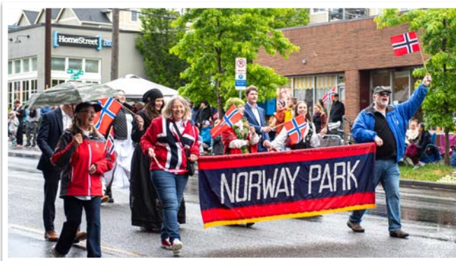
Syttende Mai 2025 with the Norway Park participants in the Ballard parade

Due to Memorial Day Weekend, the Berg Pavilion Rummage Sale will be held on the 30th & 31st of May. Contact Terry Buholm at 206-406-2029 for details.