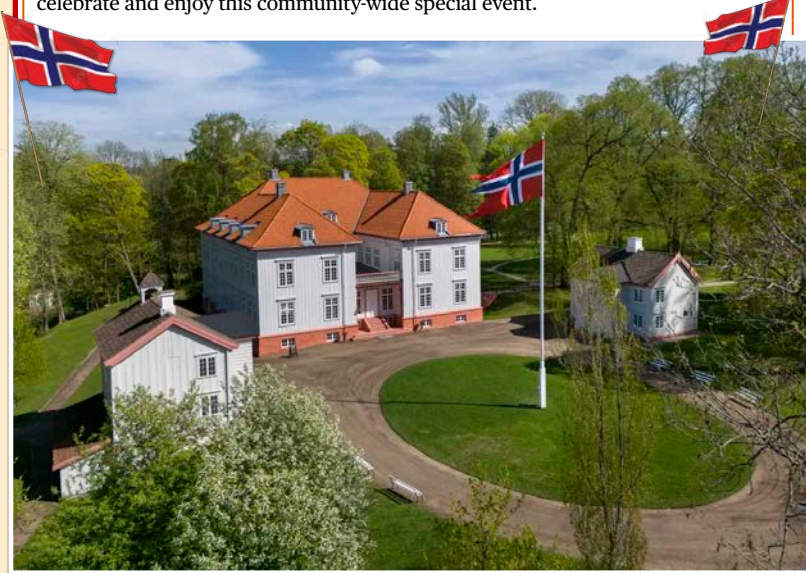
Eidsvollsbygningen (Eidsvoll Manor House) where the Norwegian Constitution was drawn up in 1814. Norge.

June 28th, Sunday: Come celebrate an authentic, traditional Skandia Midsommar at St. Edwards Park in Kenmore, beginning at 11 am. There will be music, dancing, vendors, food trucks, make flower crowns, help raise the Midsommar Pole, dance, and sing around the pole. There are many ways to celebrate and enjoy this community-wide special event.