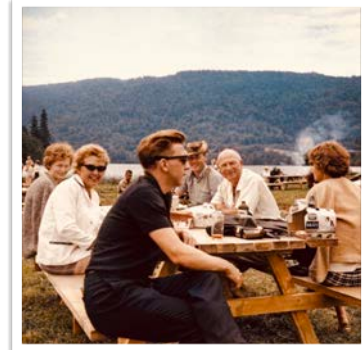
Norway Park 1966 - 60 years ago!