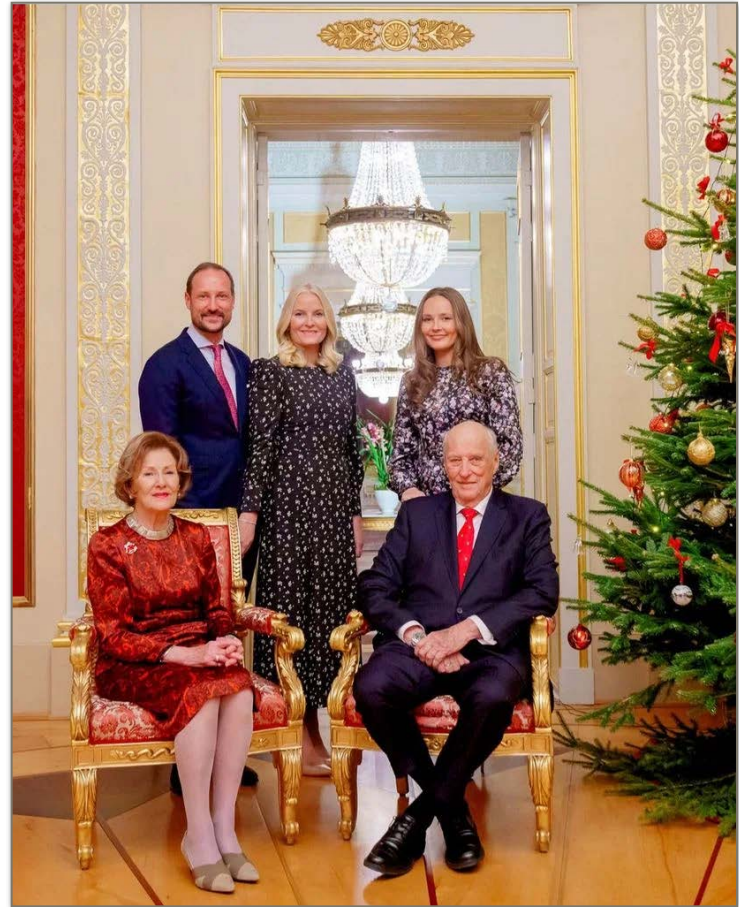
Norsk Kongefamilies Julefoto 2024.

Norwegian Royal family Christmas photo 2024.