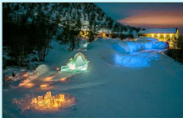
- An-Magrith Erlandsen

Hvert år blir hotellets rom skulpturert på nytt og tematisert med bilder av arktisk kultur. Nytt for Kirkenes er varme rom i stilige trehytter, som har varme gulver som standard.