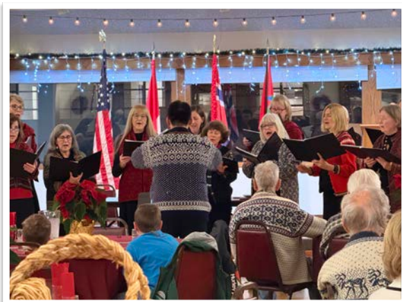
December Membership Dinner Meeting. The Norwegian Ladies Choir performs traditional Norwegian Jul Carols.