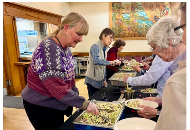
Mange Tussen Takk! to all the volunteers at the Membership Dinners.