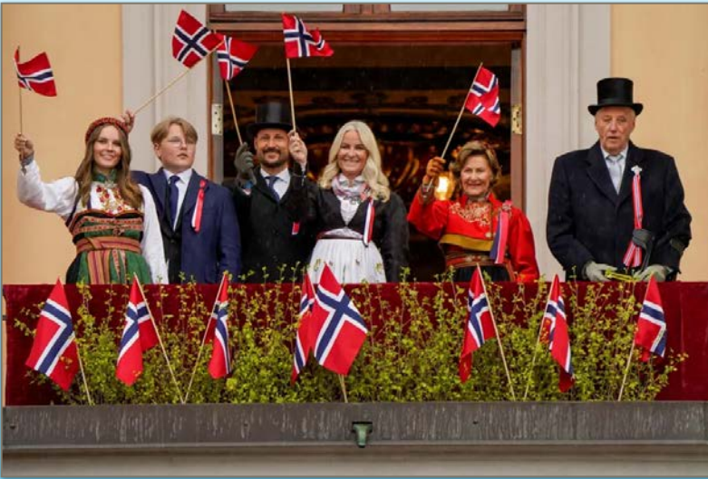
Den norske kongefamilien vinker til folket på 17. mai fra balkongen på slottet i Oslo. prinsesse Ingrid-Alexandra, prins Sverre-Magnus, kronprins Haakon-Magnus, kronprinsesse Mette-Marit, dronning Sonja, kong Harald.

Dette er en nasjonal høytid til minne om undertegningen av Grunnloven i 1814. Oslos offisielle program inkluderer minnesamvær, salutt, konsert, og barneparaden. Barneparaden starter ved Akershus festning og avsluttes på Rådhusplassen.