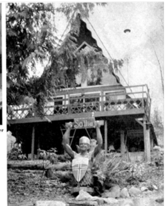
Utvandrer av norsk avfanning tilsider på det norske. Men en grunn viking i plast er kanskje til drøyene laget ...